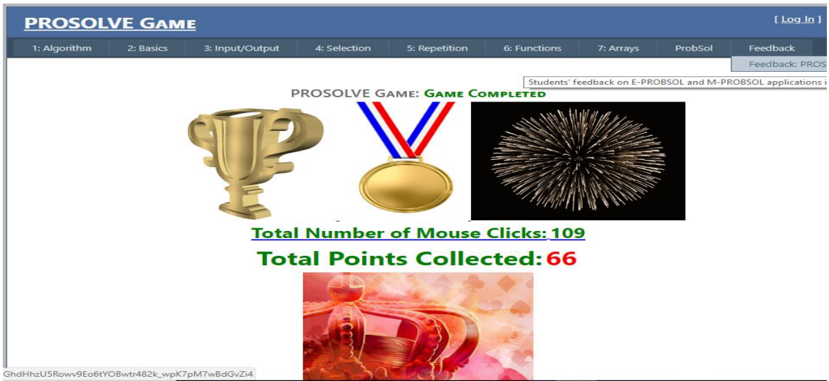
Figure 4: Game completed window of PROSOLVE game