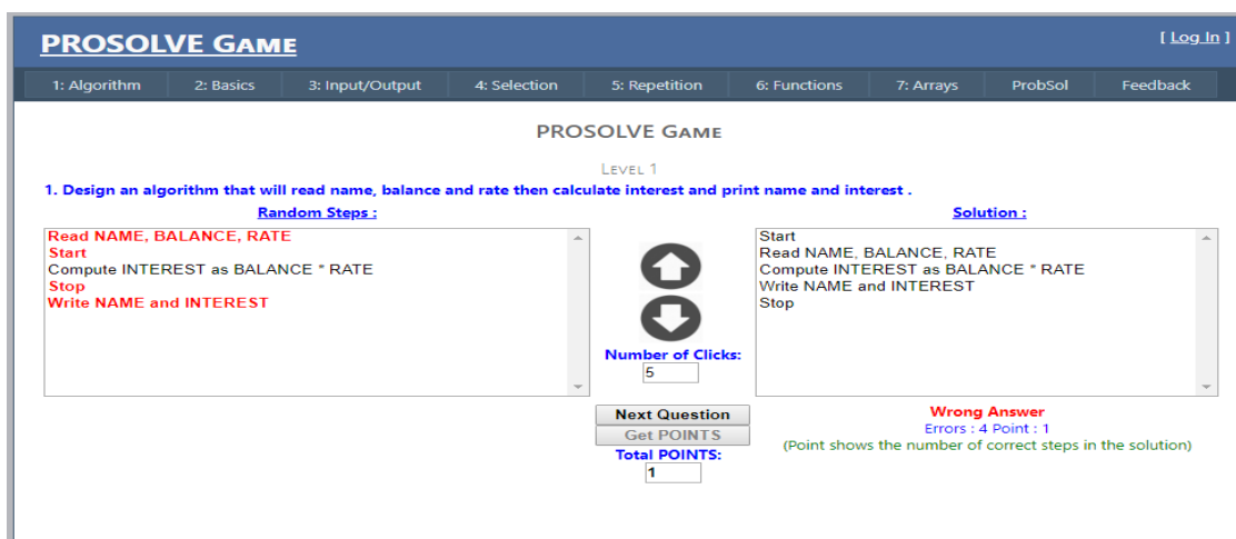
Figure 2: List boxes of PROSOLVE game

Step 1: The game consists of two list boxes (Random Steps and Solution) as shown in figure 2. The Random Steps list box shows all the Pseudo-code steps for a given problem statement in a random manner. A user re-arranges the given random steps of pseudo-code algorithm into its correct steps of sequential order by moving the steps, up or down using the 'Arrow Buttons' at right side of the list box. Number of clicks is recorded while moving the Arrow Buttons up or down. It displays a congratulatory message, if proper sequence is already achieved after the last click for its correct solution.